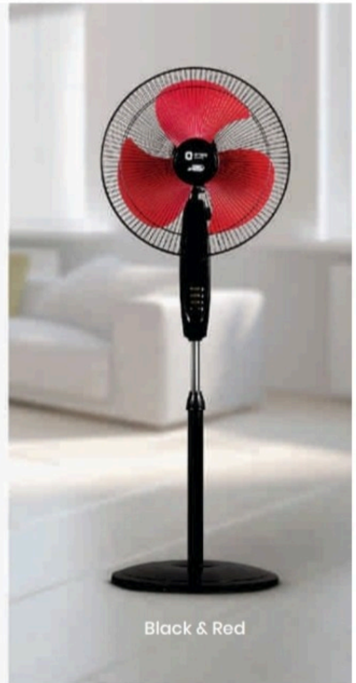
Black & Red