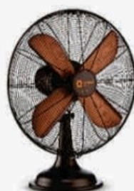
T12 Rubbed Bronze