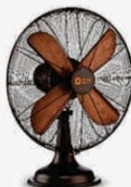
T16 HS Rubbed Bronze